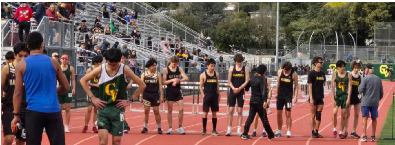
Some of Hayward's student athletes