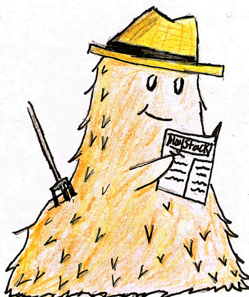
Introducing Harold, our Haystack friend!

It seems as though the freshmen in Hayward High have great aspirations. While the year is young, Freshmen are off to a great start of their first year. Even so, the Freshman will have a lot to look forward to, including the highly anticipated Downtown Rally, the Homecoming dance, Club Day, multi-themed and seasonal spirit weeks, Hay Day, and all sorts of events that will be held throughout their four years in Hayward High.