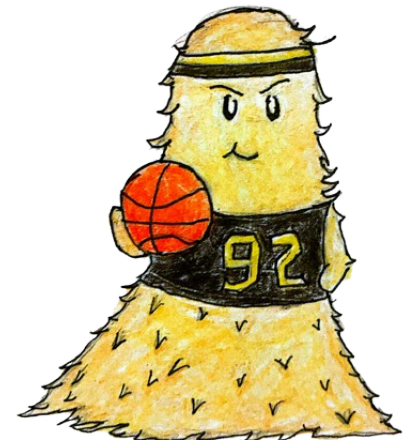
Basketball Harold: Isla Salgado

Many schools all across California are expected to start having meetings with parents, teachers, and students in order to decide how the ban should be implemented in each local area. Furthermore, over the next two years, meetings will be held with staff members and parents in order to communicate the rules that they'll choose to change and/or implement.