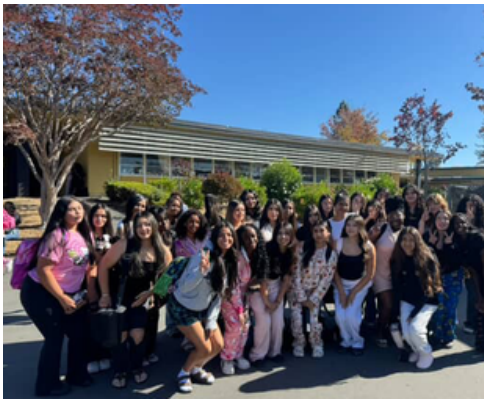
Cheer on Spirit Week Day 1: Pajama Day

Newsletter Vol. 1, Issue 3 October 6, 2025